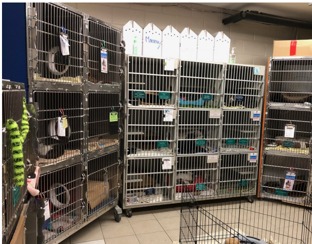
Current Feline Capacity Holds 1,200 cats per year

Adopter, Key Volunteer, and Feasibility Study interviewee 🐾