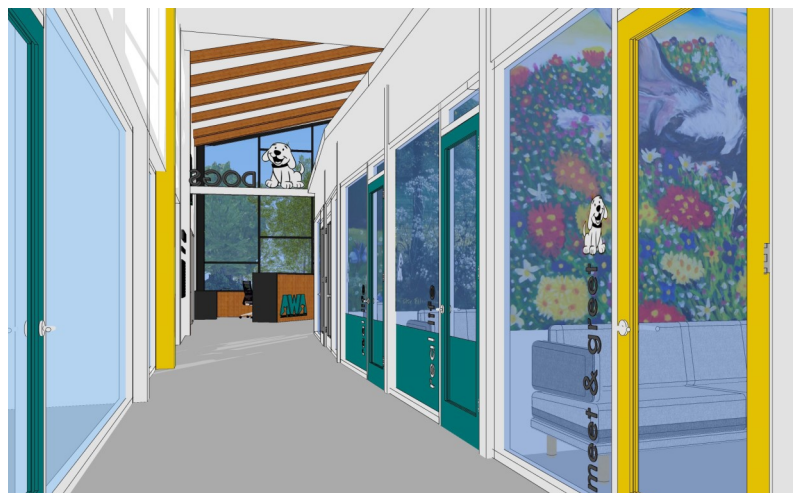
New Canine Wing A substantially larger canine wing will allow AWA to increase its capacity to 75 dogs at any point in time.