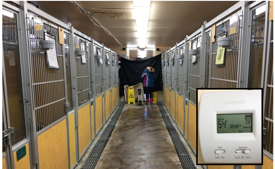
AWA staff hang blankets in front of doors to try to keep dogs warm during the winter.

The entire 50 year-old shelter has outlived its usefulness. There are four facility challenges that impede AWA from accomplishing its mission and realizing its vision.