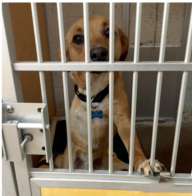
Current Canine Capacity There are kennels for 37 dogs.