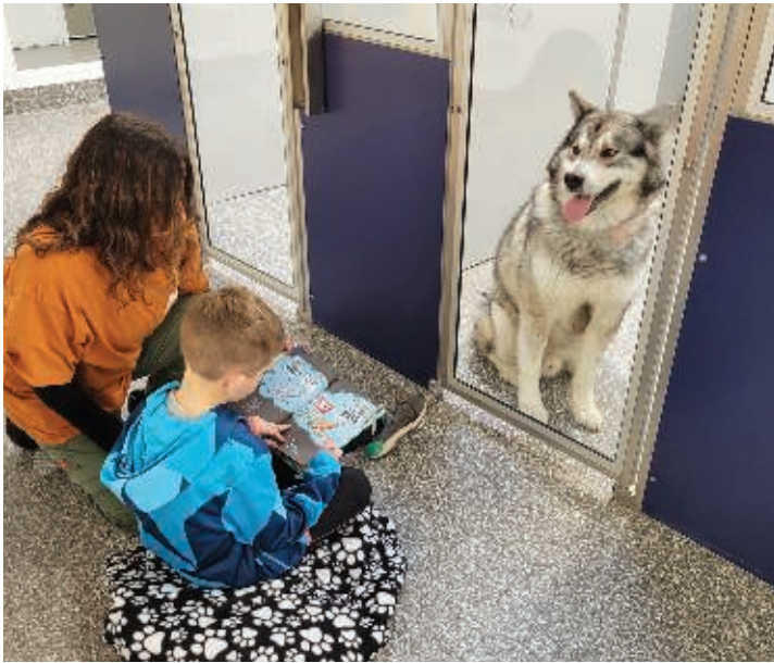
AWA's Tales With Tails Reading Program