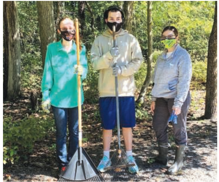
P.A.W.S. Program participants cleaning AWA's walking trails.