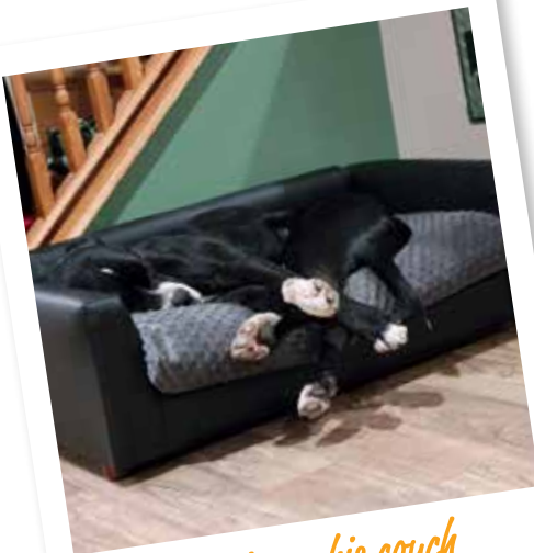
Mr. Big on his couch

Mr. Big (now Brewzer) is such a big goofball and a cuddler. He loves that he has a big backyard to play with his ball. Then, he gets to come in and take a snooze on his own personal couch to build up some energy to play some more!