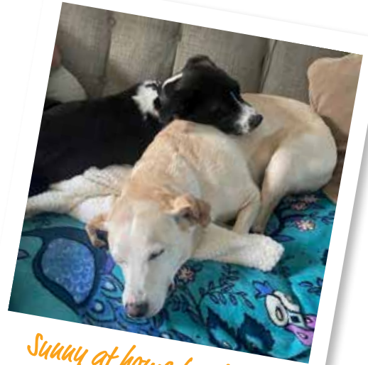
Sunny at home (on left)