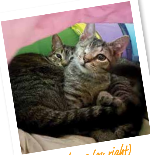
LJ at home (on right)

LJ, formerly Spencer, is doing terrific! All of his brothers and sisters love him. He especially bonded quickly with my three legged cat and my larger dog. I think he is loving his new home!"