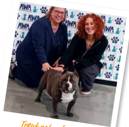
Trent got adopted!

1,459 dogs, cats and small furries found their forever homes at AWA in 2022